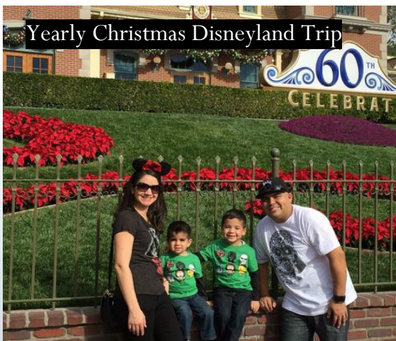
Yearly Christmas Disneyland Trip