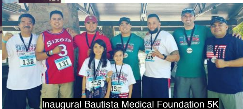
Inaugural Bautista Medical Foundation 5K