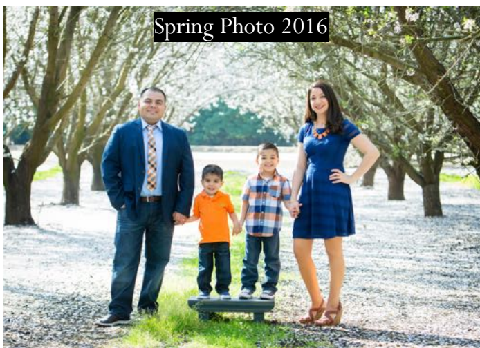
Spring Photo 2016

As we all know, the healthcare climate is changing. With more insured individuals and less providers to treat them, there is a great opportunity for Optometrist to take the helm and help alleviate some of that strain. Unfortunately, we are a very legislated profession and our scope of practice is dictated not by our training and ability, but by those with much deeper pockets than us. It was through the dedication and hard work of the Optometrist in the AOA before us that we are able to use topical drops, prescribe orals and treat glaucoma. But our fight is far from over and we have new challenges from online retailers like 1-800-Contacts and Opternative who want to deregulate the way we practice and devalue our services. Being part of the CCOS affords me the opportunity to continue the fight against these new challenges alongside some of the brightest and most experienced members of our association. It's also a great way to stay connected with my colleagues and share practice building ideas and opinions and experiences on new products.