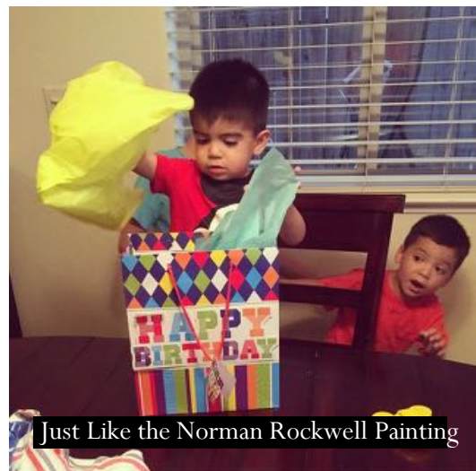
Just Like the Norman Rockwell Painting